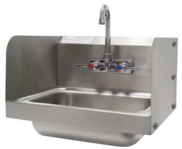
Welded Side Splashes Factory Installed Only